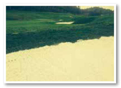
The result is a beautiful edge, which is permanent and maintenance friendly.